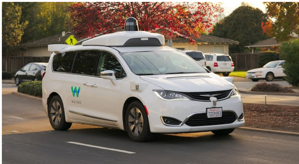
Figure 6. Waymo Chrysler Pacifica Hybrid minivan used as robotaxi in Chandler, Arizona.

Fleets of robotaxis and delivery vehicles are usually mentioned as the first applications of SDC technology to general-purpose driving. Ford is launching a fleet of pizza-delivery vehicles in Miami. Ford and GM plan to launch fleets of robotaxis in various cities, and Waymo already has [Figure 6].