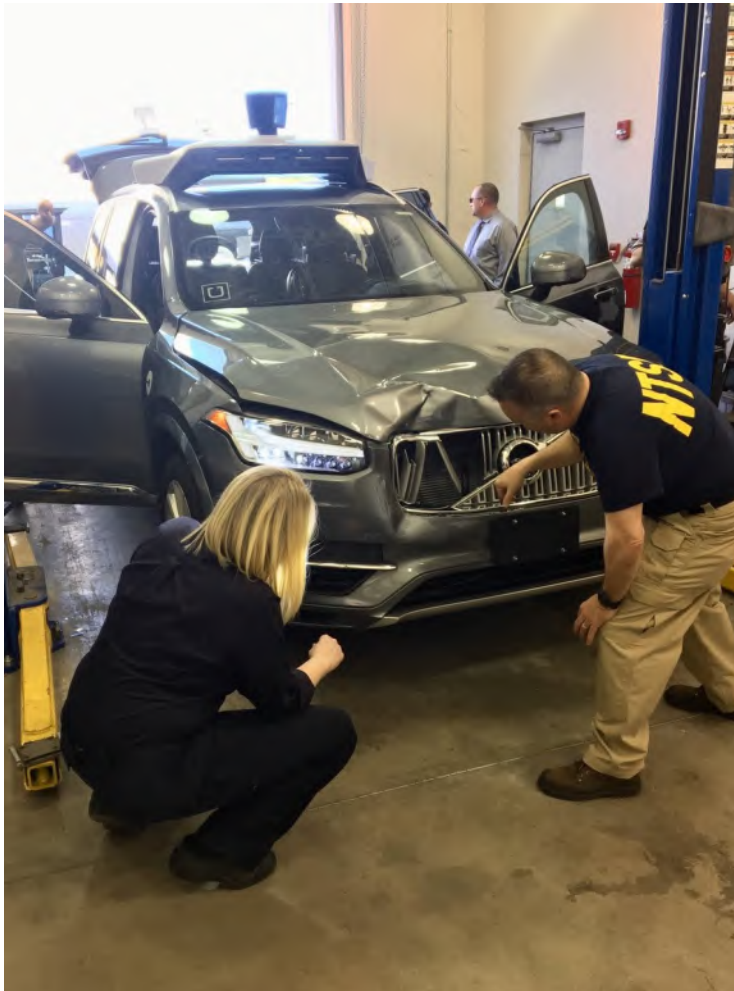
Figure 5. National Transportation Safety Board employees examine an Uber autonomous car involved in a fatal crash in Tempe, Arizona.

Illustrations of the political risk were common in the months following fatal SDC accidents involving Uber in Arizona and Tesla in California in 2018. See Figure 5. After these accidents, a US Senator wanted “to ensure semi-autonomous cars are also included in [an SDC-related] bill, that there are requirements for all of the vehicles to have a manual override and that there is more transparency with the data and safety evaluations” [50]. A Consumers Union specialist on SDCs, commenting on the bill, said, “We want to make sure that data is broadly shared to demonstrate their safety before the rest of us have to be guinea pigs sharing the road” [50].