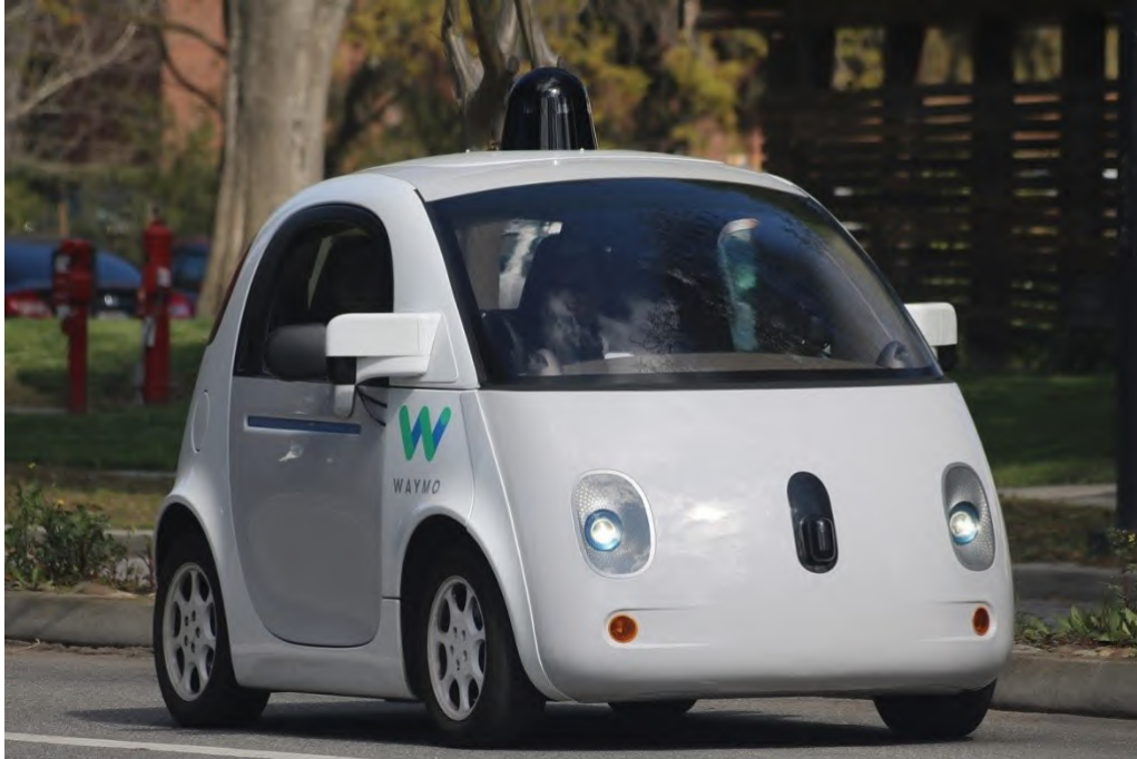
Figure 1. A self-driving car on the road in Mountain View, California