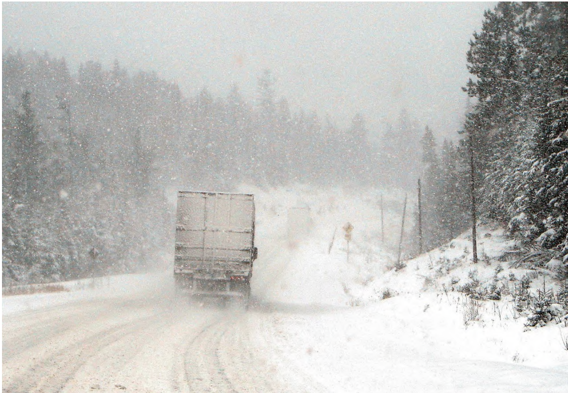
Figure 3. Small clouds of snow, ice, and slush thrown up by truck tires

Extreme weather conditions create several problems for sensors. Figure 3 illustrates one of them—the vulnerability of sensors to being obstructed by snow, ice, and slush thrown by other vehicles.