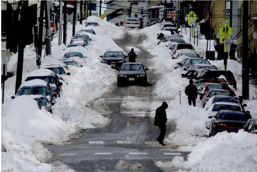
Figure 4. Shoveling out after a heavy snow

Cleaning the snow and ice from and around a car after a heavy winter overnight storm can take substantial time. Currently, Lyft and Uber avoid this problem because their drivers double as snow-removers, cleaning their own vehicles of snow and ice or keeping them in their own garage. But robotaxis will not have drivers, and thus a robotaxi company will have to keep a significant number of employees available at short notice for part-time snow removal work—after a snow or ice storm hits the area. This requirement will raise the cost of the robotaxi service in addition to being difficult for managers to administer.