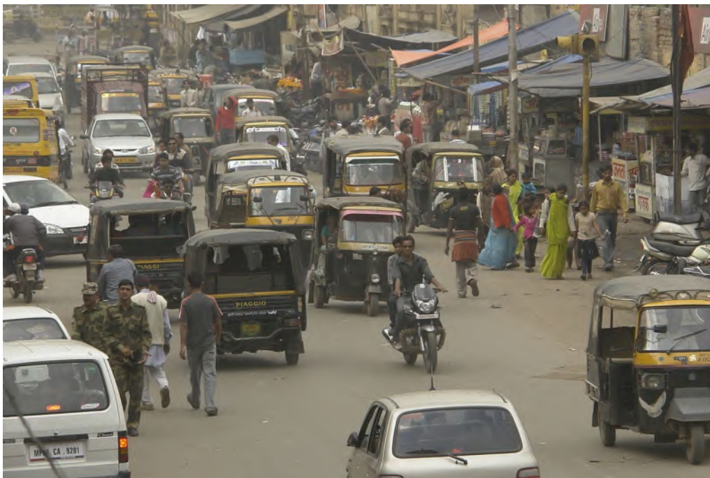
Figure 2. “People are able to use their commonsense understanding of the world ... to act sensibly in all sorts of new situations.” Yibiao Zhao.

Figure 2 shows a traffic environment where a traffic pattern may be difficult to identify and commonsense is essential.